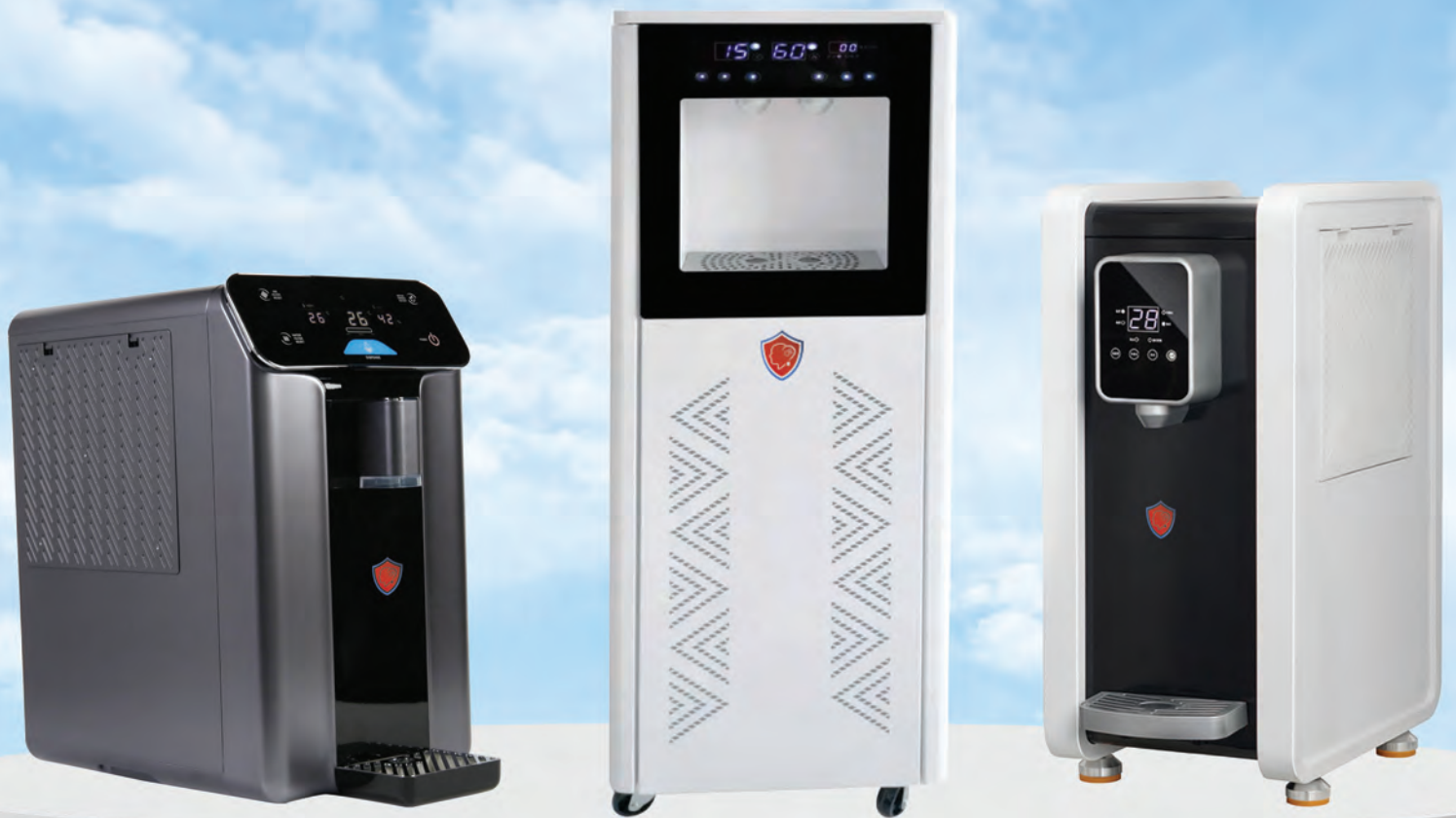
Air water making machine