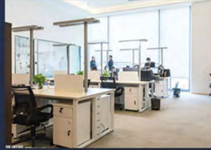
Office drinking water